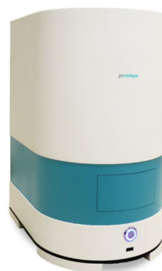
Clarity™ Digital PCR Reader